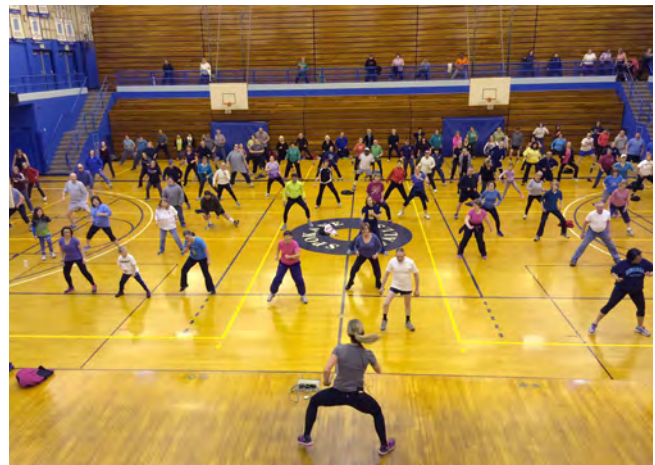
Group Health hosts free training programs to prepare runners for the Bloomsday Run.