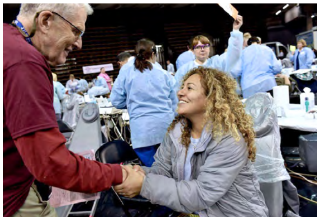
People of all ages came to get care at the Seattle/King County Clinic.

Group Health also supported residencies in nursing, pharmacy, and optometry, and trained student interns in our Physical and Occupational Therapy and Speech, Language, and Learning Services departments.