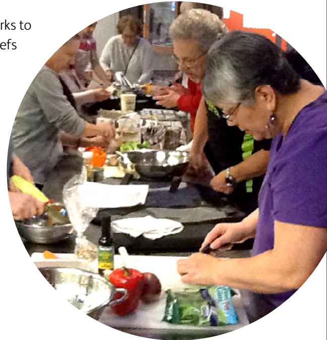
Cooking students at Tacoma’s Star Center

The classes are free and open to the public.