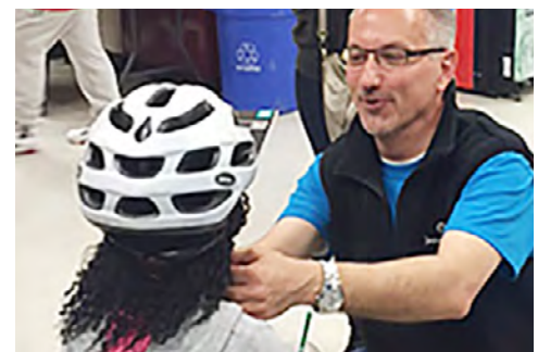
Free bike helmets and free fittings help keep kids safe.